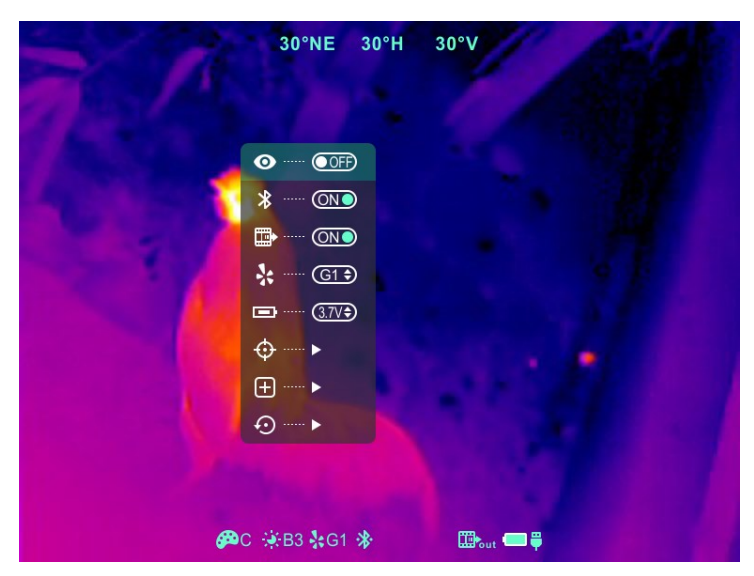
Fig.4-2 Advance menu

In the normal display mode, long press the rotary encoder for 2 seconds to enter the advanced menu. There are 8 operations as shown in figure 4-2. From top to bottom the options are Ultraclear mode, Bluetooth, Video out, Zeroing type, Battery type, Image calibration, Blind pixel correction, Factory reset. If there is no operation within 5 seconds, it will exit the menu automatically. Or it will exit after long pressing the encoder for 2 seconds.