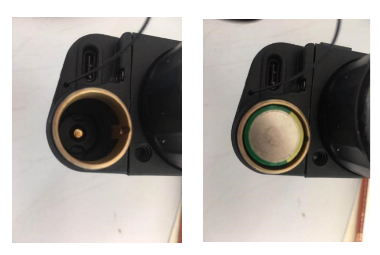
Fig. 5-1 Schematic diagram of battery installation