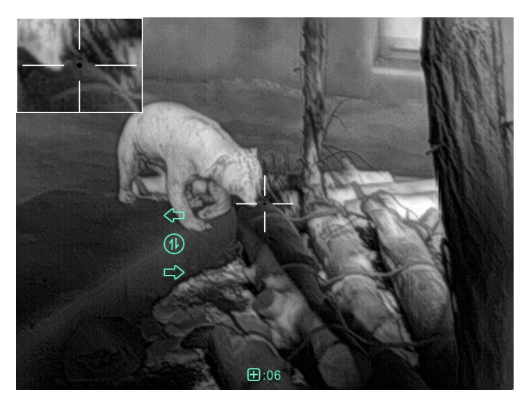
Fig. 4-4 Blind pixel correction interface