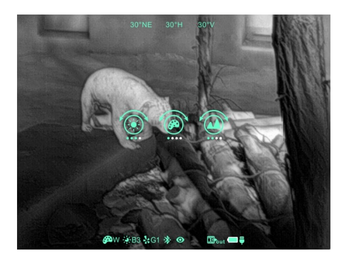
Fig. 4-1 Shortcut menu

Short press the encoder to switch the order of "no menu - Brightness - Image mode - Sharpness - exit shortcut menu". And rotating encoder can adjust the parameters of each function. If there is no operation within 5 seconds, it will exit the shortcut menu automatically. The functions of shortcut menu are as shown in fig. 4-1