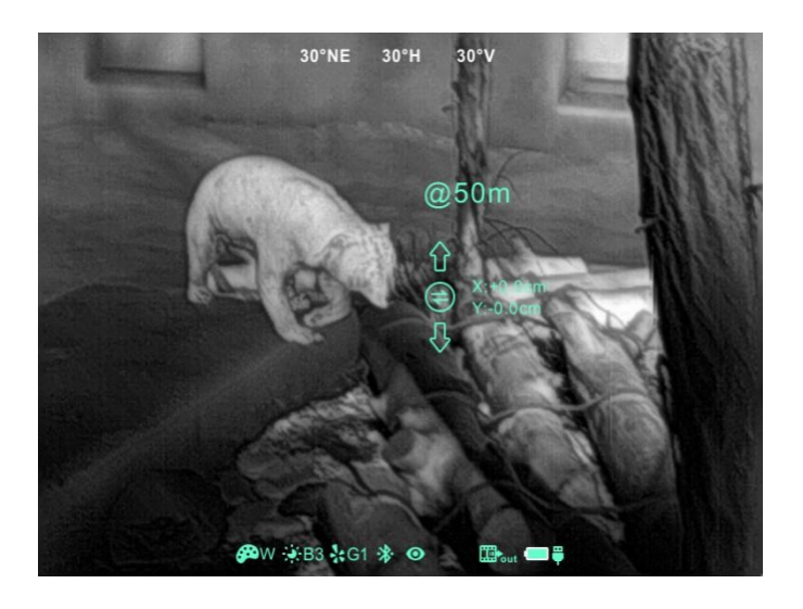
Fig. 4-3 Image calibration interface