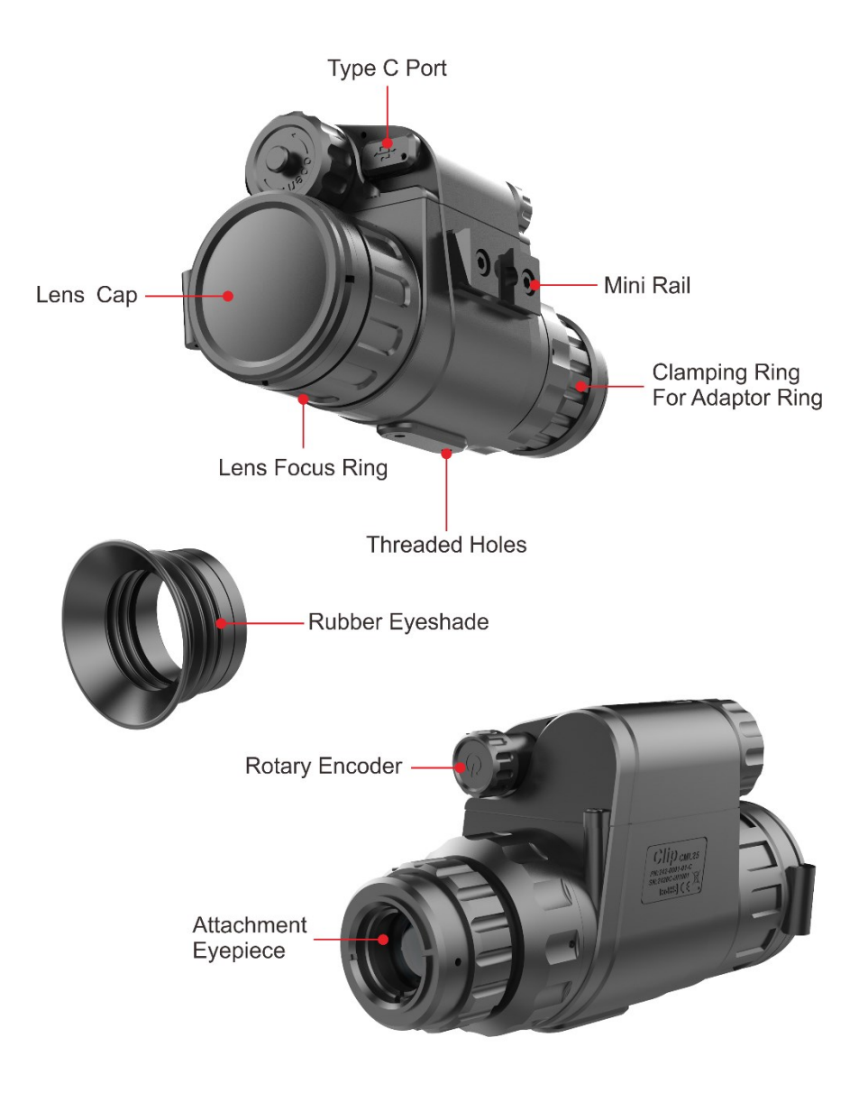
Fig. 2.1 Function introduction