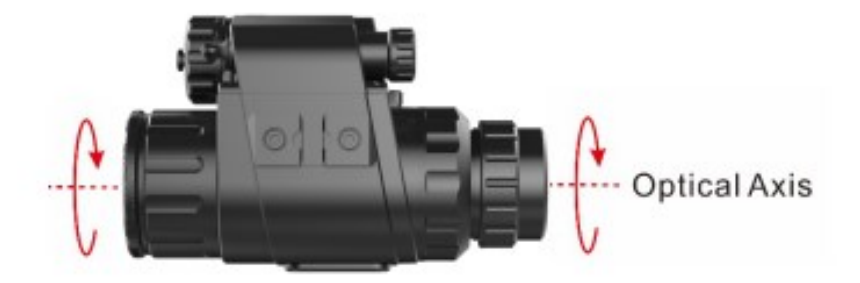
Fig. 4-5 Rotate direction